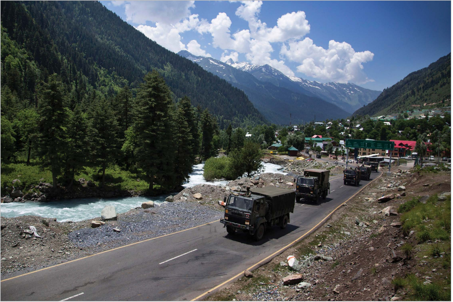
An Indian army convoy moves on the Srinagar-Ladakh highway northeast of Srinagar, India, on June 17, 2020.