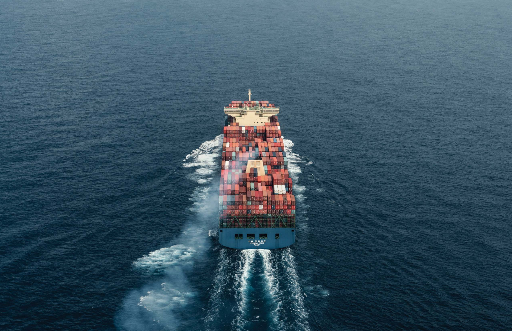
A cargo ship navigates one of the world's busiest shipping lanes, near Hambantota, Sri Lanka, on May 2, 2018.

over the course of 2020 to examine how an array of issues—from military affairs to border disputes, trade and development, and cultural issues—come together to shape and be shaped by Chinese involvement. The group members drew from their deep individual experiences working in and advising the US government to generate a set of focused, actionable policy recommendations. The report includes this executive summary that details the group's findings and recommendations and is followed by deeper explorations of US interests in South Asia amid China's growing role; Beijing's interests in and approach toward the region; China-Pakistan relations; China-India relations; and China's relations with the smaller South Asian states—Afghanistan, Bangladesh, Bhutan, Maldives, Nepal, and Sri Lanka. 2