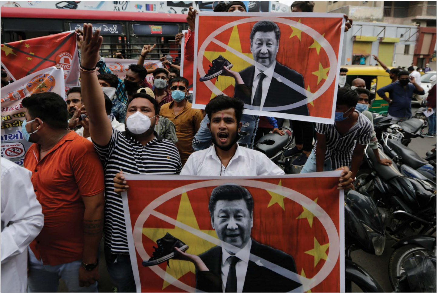
Demonstrators hold banners featuring Chinese General Secretary Xi Jinping during a protest against China in Ahmedabad, India, on June 24, 2020.

record of employing coercive actions in international disputes and abandoning diplomatic agreements when doing so advantages Beijing. During flare-ups, the United States should avoid reflexively pressing for concessions from both sides when one party is driving escalation.