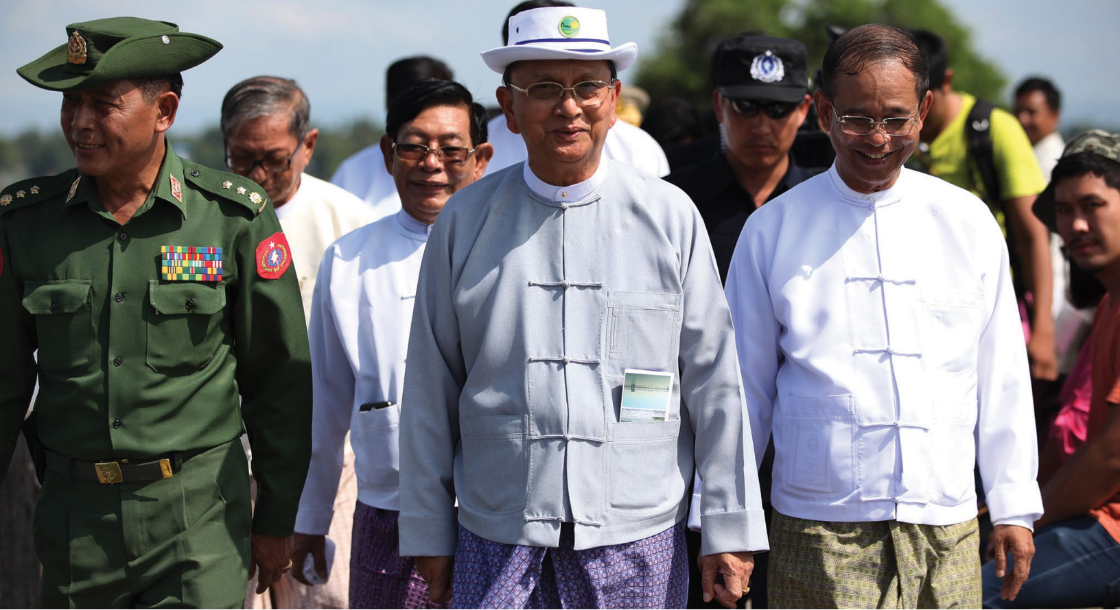
Then president of Myanmar Thein Sein, center, walks on the historic U Bein bridge while assessing environmental changes at Taungthaman Lake in Amarapura, near Mandalay, Myanmar, on September 27, 2015.