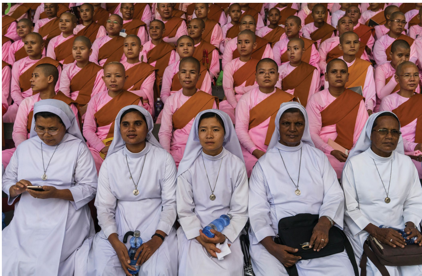
Buddhist and Roman Catholic nuns at the Interreligious Gathering of Prayers for Peace in Yangon on October 10, 2017.