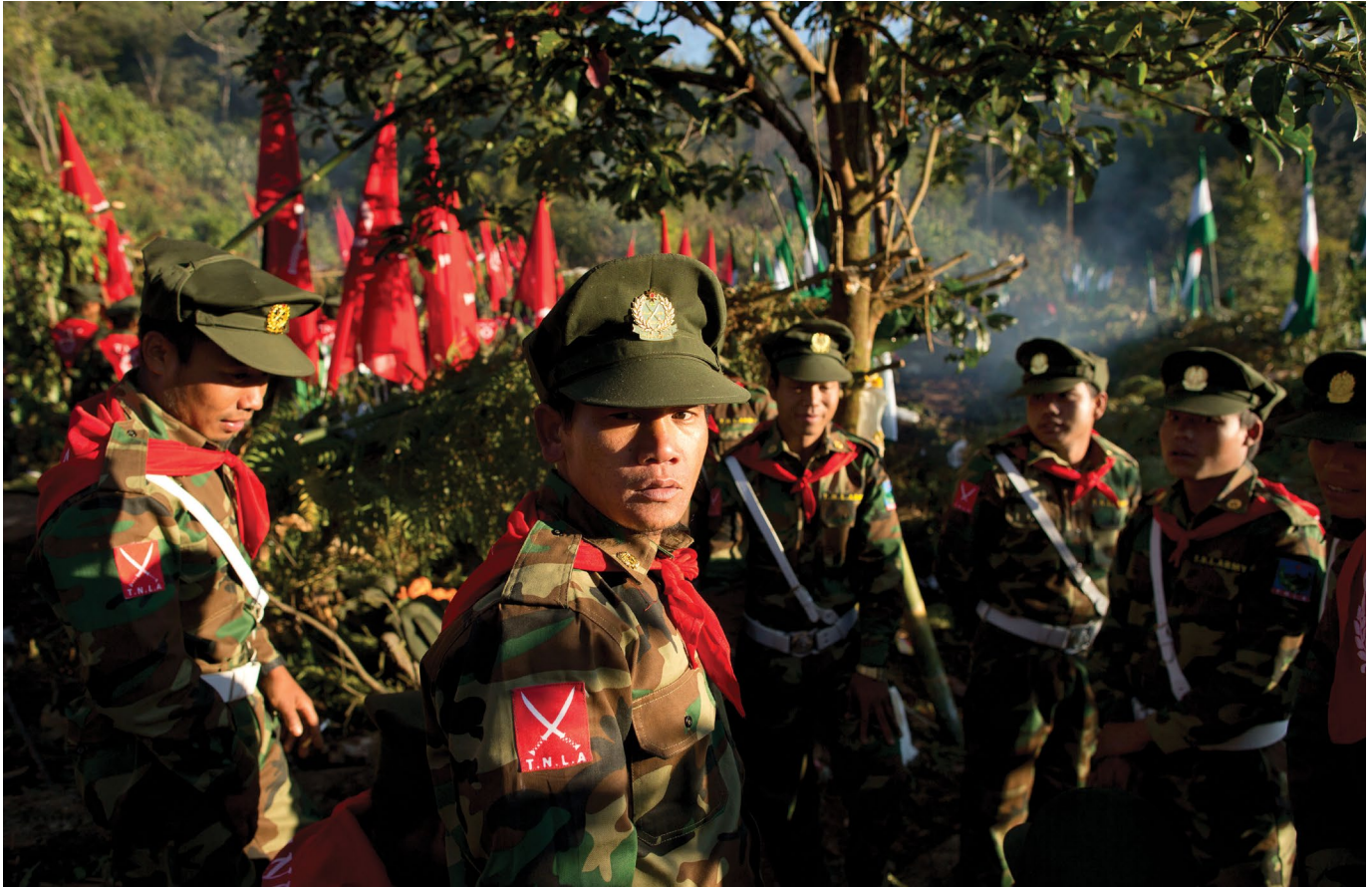
Officers with the Ta'ang National Liberation Army gather in Mar Wong, a village in northern Shan State, on January 12, 2015, marking the fifty-second anniversary of the Ta'ang (Palaung) organizing against the rule of General Ne Win.

are still alive and should be consulted. In this regard, foreign peace activists should listen and learn, and not be—as, unfortunately, the case often is—patronizing. Because one approach to a conflict somewhere else in the world was successful, it does not mean that it is applicable to the situation in Burma. The attitudes of foreign peacemakers should be modesty, humility, and willingness to learn, not to lecture. Only then can domestic and foreign parties work together constructively and share ideas.