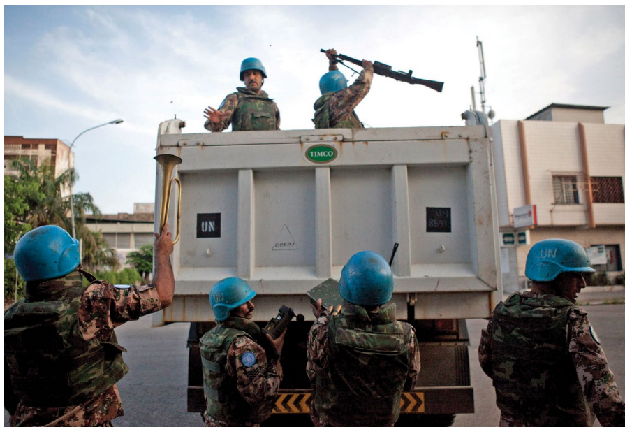
UN peacekeeping troops collect weapons and other materials from the army headquarters of Côte d'Ivoire's strongman Laurent Gbagbo in April 2011.