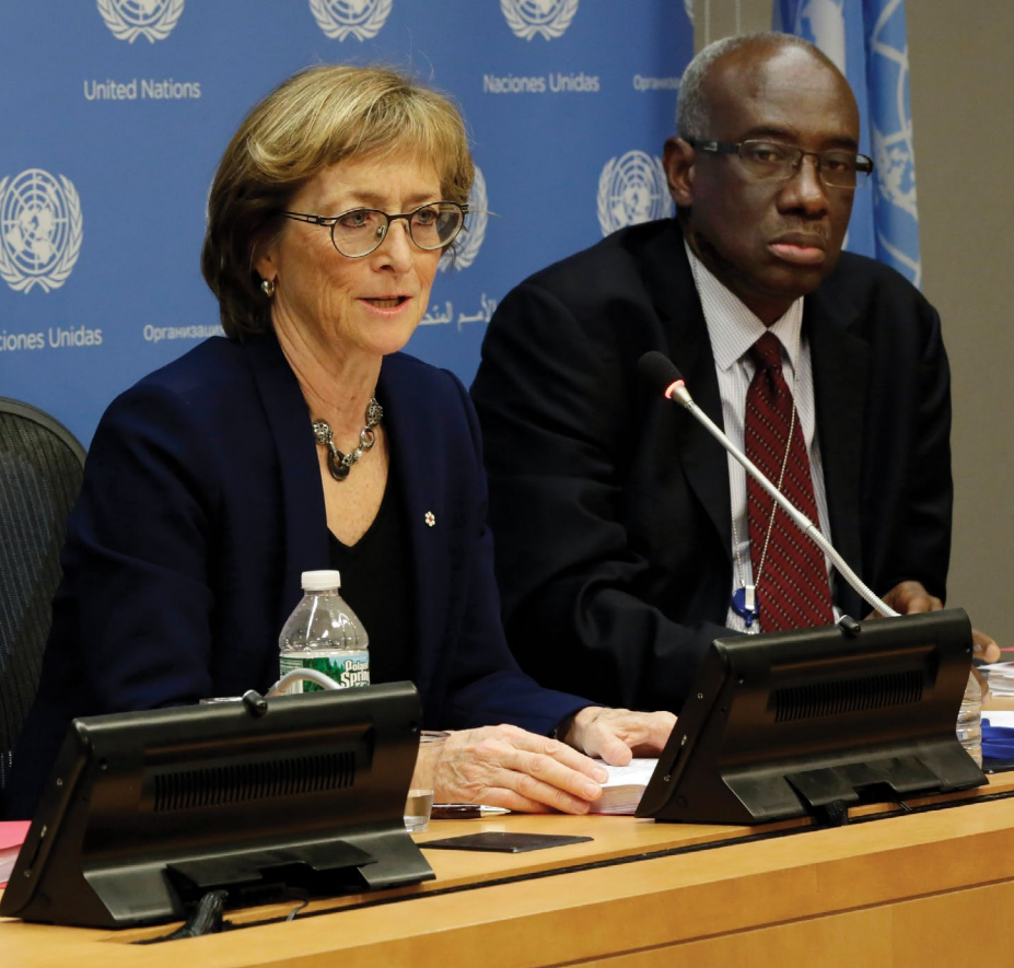
Canadian judge Marie Deschamps (left), chair of the Independent Review Panel on UN Response to Allegations of Sexual Abuse by Foreign Military Forces in the Central African Republic, speaks at a news conference at the United Nations on December 17, 2015.

ipated failure.” 27 When the onus of accountability falls on troop-contributing countries, which often have limited capacity, they are given a task that even heavily funded national militaries, such as the US military, are unable to address effectively. 28