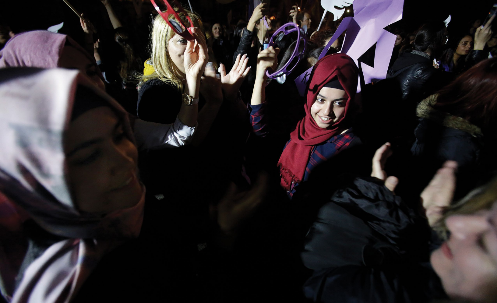
Turkish Cypriot women attend a peace rally in Ledras Palace inside the UN buffer zone in the divided capital Nicosia, Cyprus, on March 8, 2017.