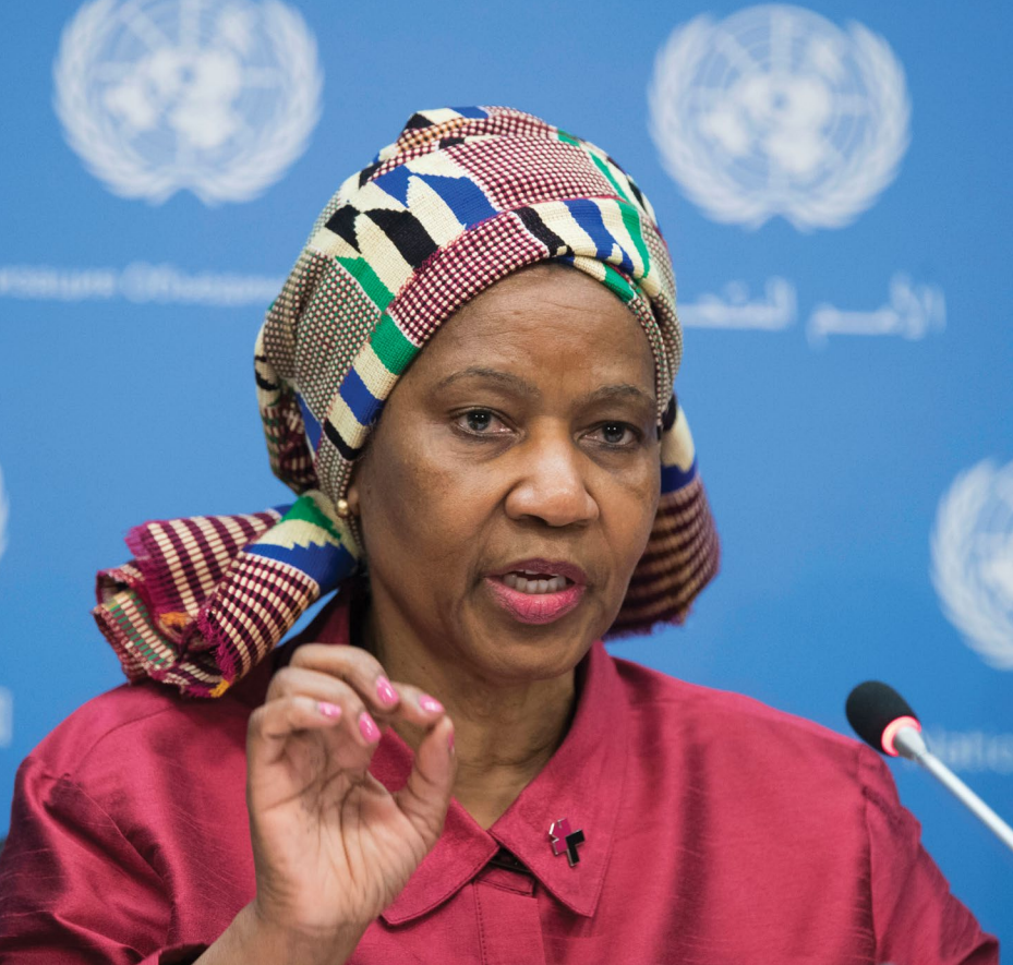
Phumzile Mlambo-Ngcuka, the executive director of UN Women, speaks to reporters during a March 15, 2017 news conference at U.N. headquarters.

in the field. In 2006 the UN began keeping records of these allegations in peace operations. From 2008 through 2018, the UN's Department of Field Support (DFS) also managed a confidential misconduct tracking system that allows allegations to be reported anonymously; the Department of Operational Support (DOS) took over the system in 2019 when it replaced the DFS following a UN