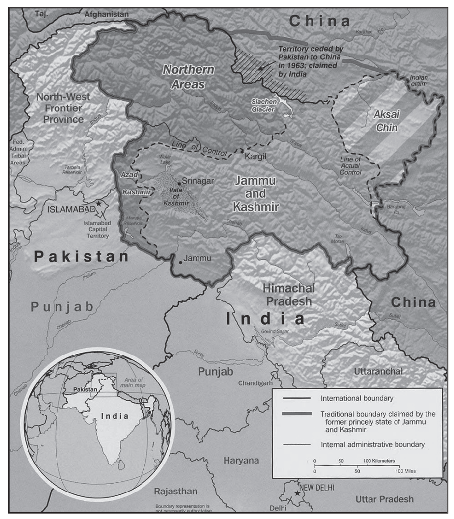
The Kashmir Region