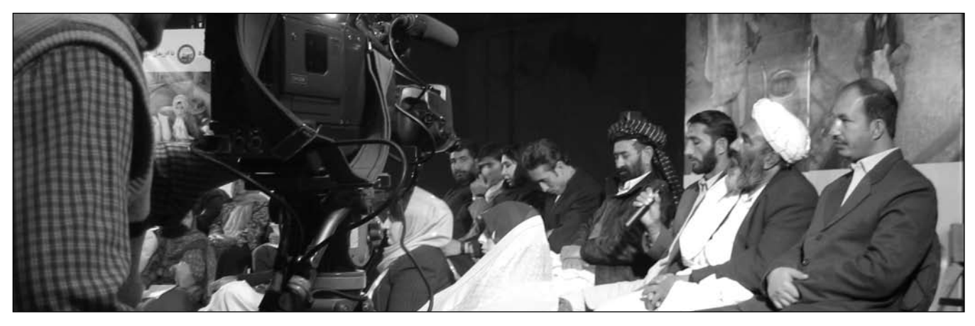
PEACEWORKS • DECEMBER 2010 • NO. 68

[We suggest ... funding media ... interventions with specific timeframes during which donors invest in the production of contents that support specific social change objectives defined by Afghans.]