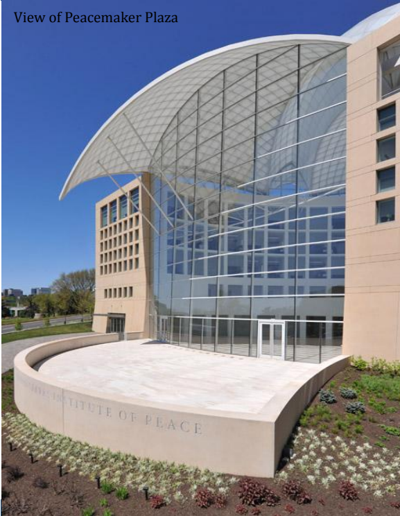
View of Peacemaker Plaza