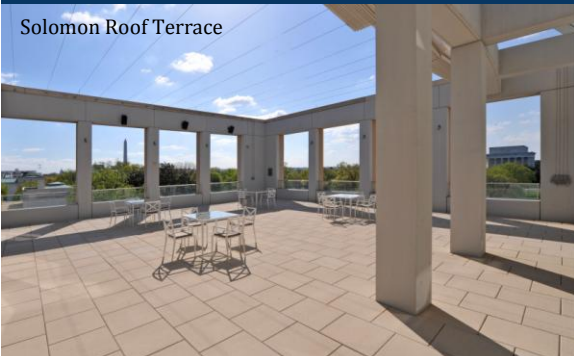
Solomon Roof Terrace