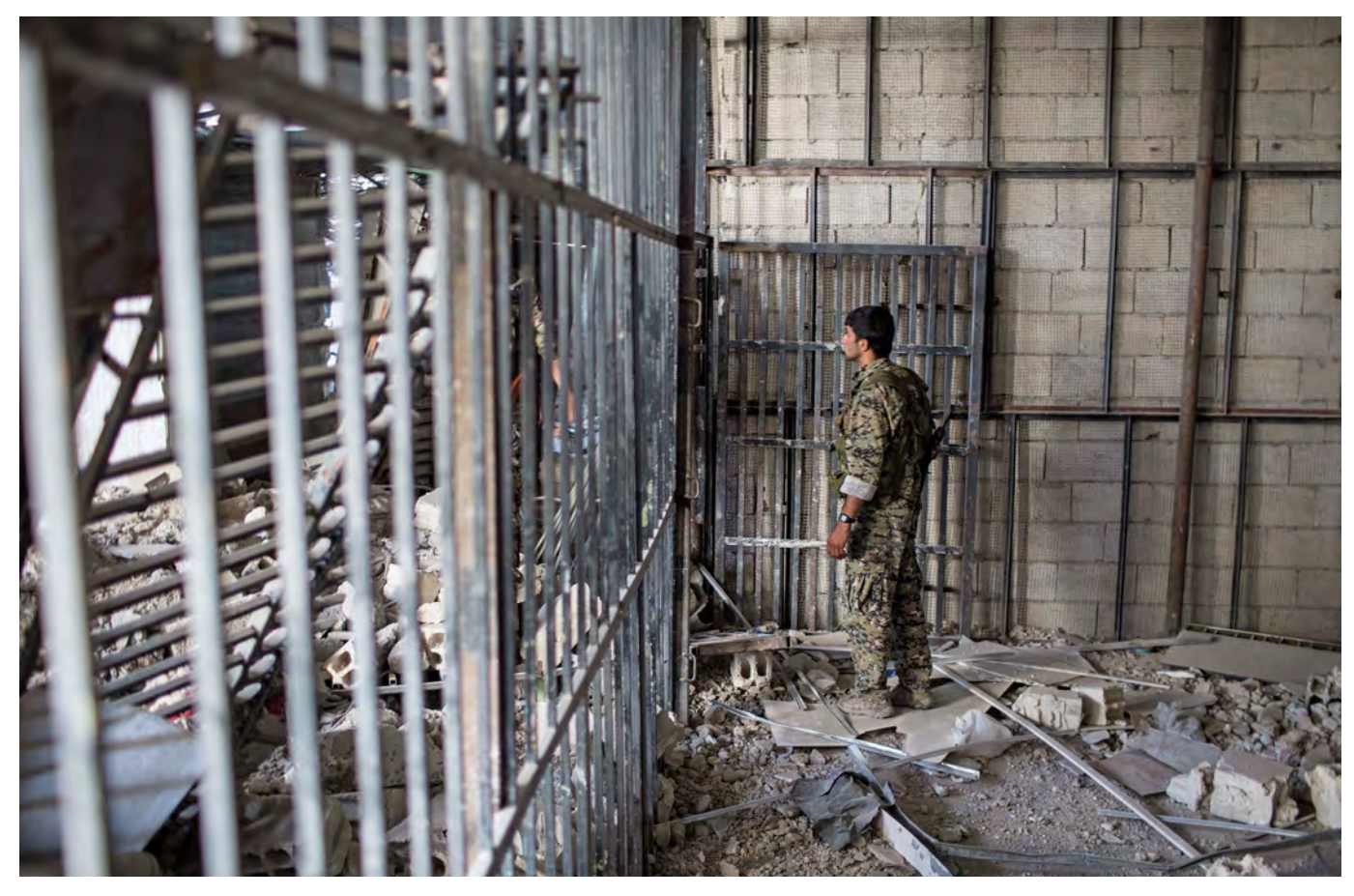
On October 20, 2017, members of the US-backed Syrian Democratic Forces walk inside a prison built by Islamic State fighters at the stadium that was the site of Islamic State fighters' defeat in Ragga, Syria.

relationships, rather than the sport or creative activities that a program delivers.