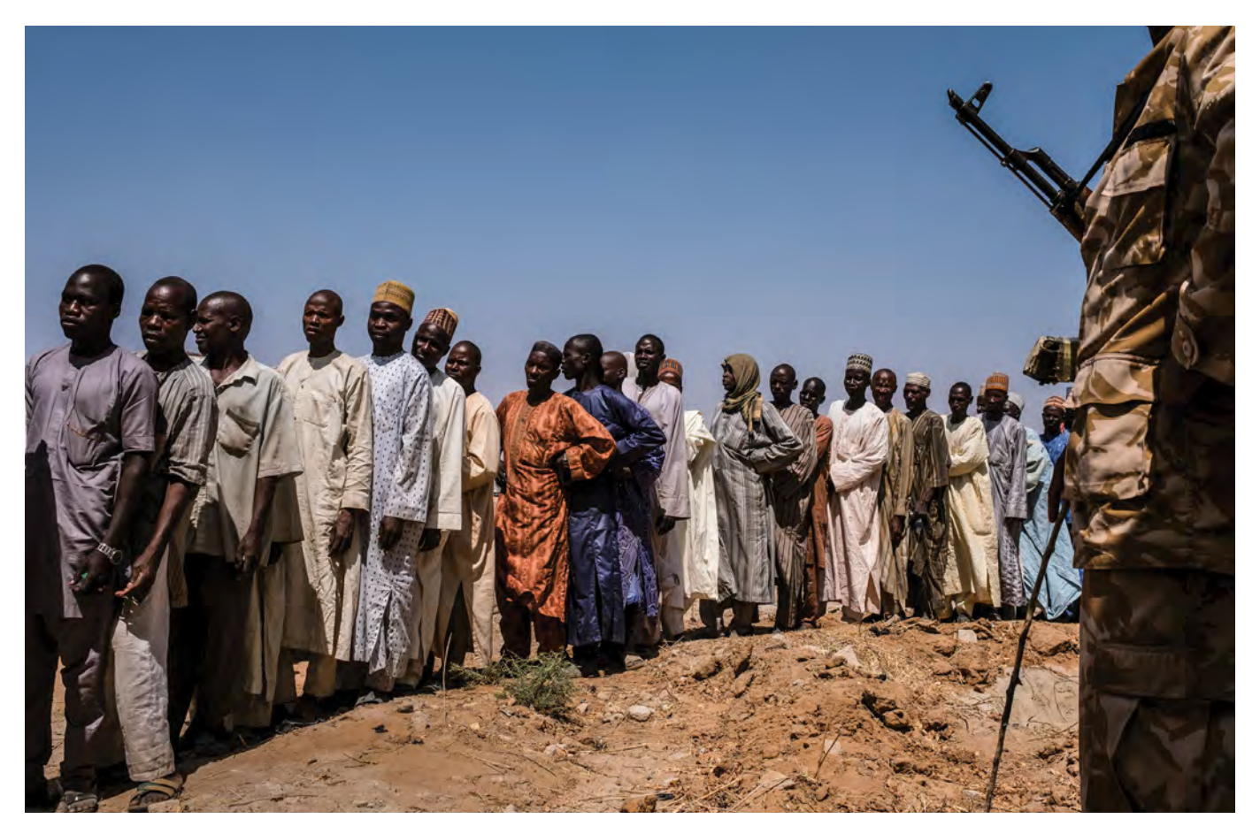
People line up for food being distributed with military oversight in Borno State, Nigeria, on February 11, 2017.

For disengagement and reintegration, the economic, political, and social conditions in each country constrain what can be achieved and how. Despite the ongoing conflict in the North East, Nigeria enjoys relative stability, which partly accounts for the maturity and growing scale of its flagship disengagement program. Significantly, OSC is in many ways a continuation of the NSC, which was developed by the previous administration, a succession pointing to the underlying degree of consensus within Nigeria that the Boko Haram insurgency cannot be defeated militarily. Nevertheless, political pressures have affected the conduct of OSC, which in its early phases struggled to achieve support from some communities and still faces criticism (including some that is politically motivated). In addition, lack of institutional capacity constrains the effectiveness of both OSC and the complementary prisons program.