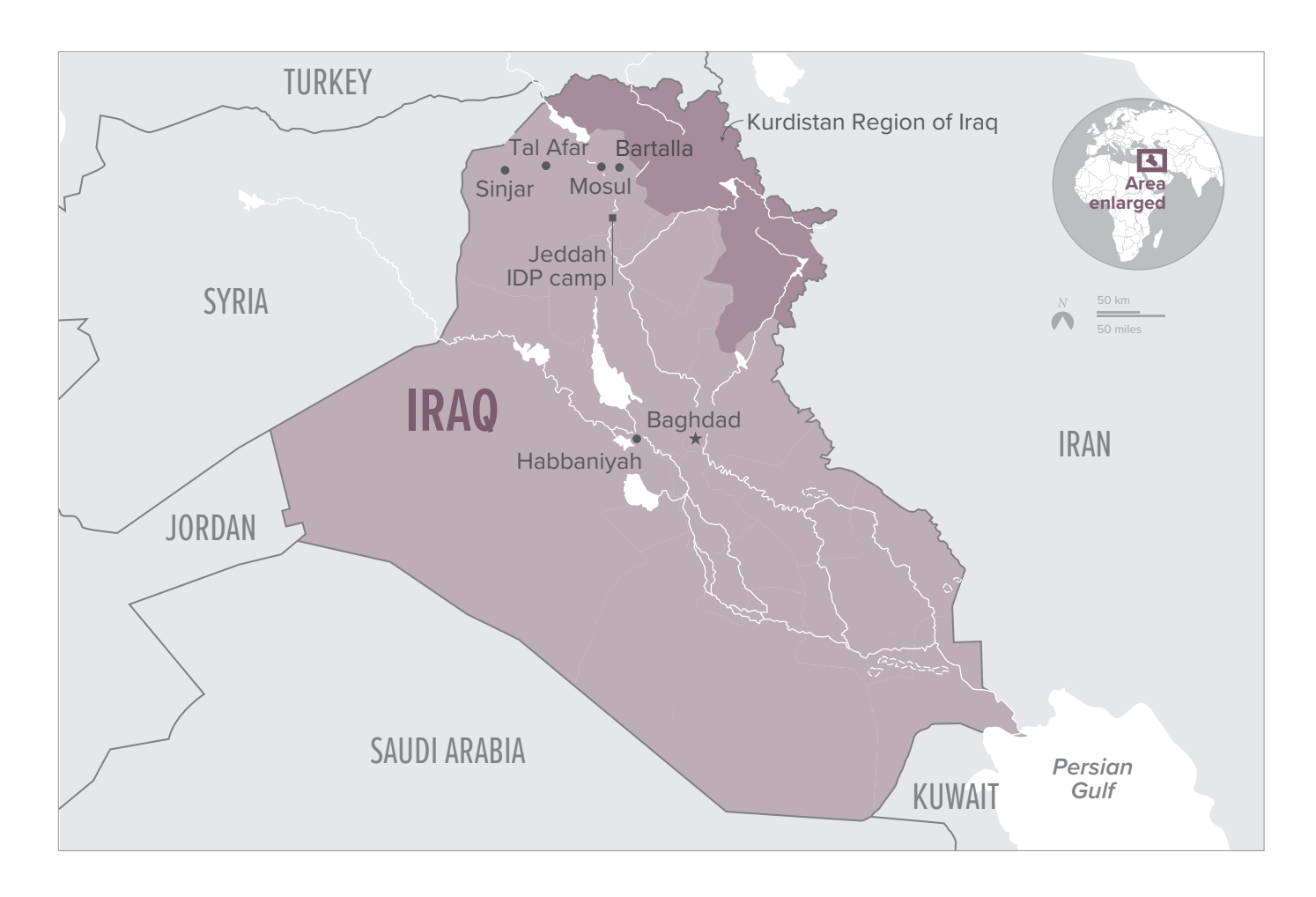
Iraq

government, local authorities, and communities as a form of "collective punishment," with rights being infringed and basic services withheld. Another said that the adverse perception could arise for any number of reasons other than actual affiliation: female-headed households or families in certain internally displaced person (IDP) camps are routinely viewed as suspect.<sup>24</sup> As of 2020, FPAs numbered over 60,000 families (around 300,000 people) in at least 77 IDP camps, most of which have since been closed.<sup>25</sup> A consistent message in the literature and in responses from interviewees for this study was that, while community attitudes vary, in general there is enormous reluctance to accept ISIS-associated individuals or their families into communities. As the subgovernor of one town in northern Iraq wrote in an email to the author: