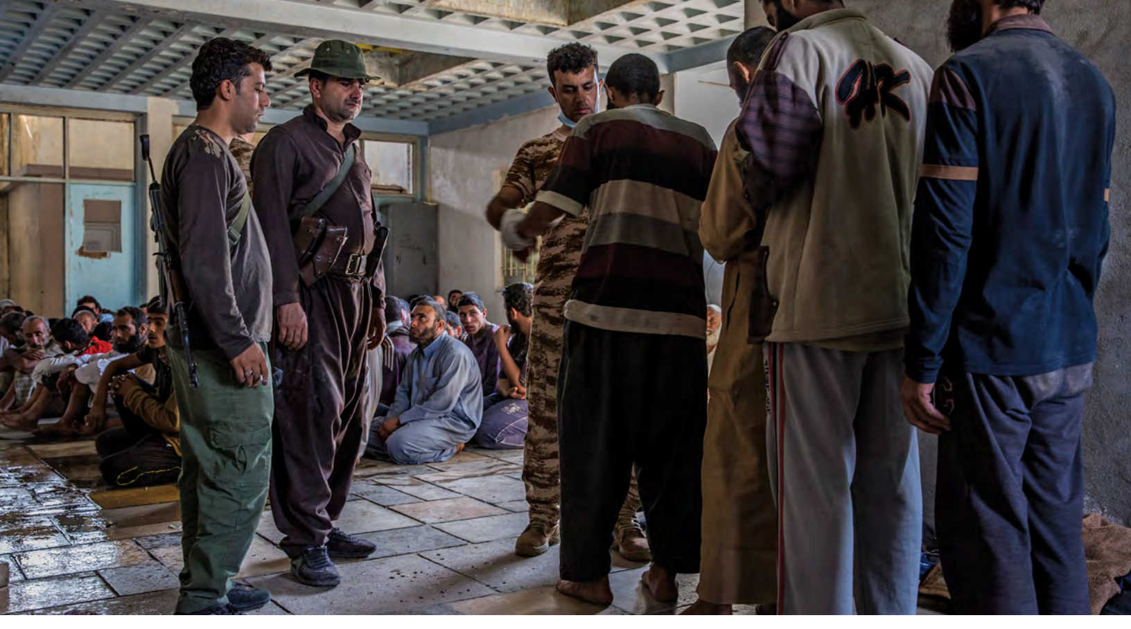
Men suspected of being Islamic State fighters are searched at a security screening center near Kirkuk, Iraq, on October 1, 2017.