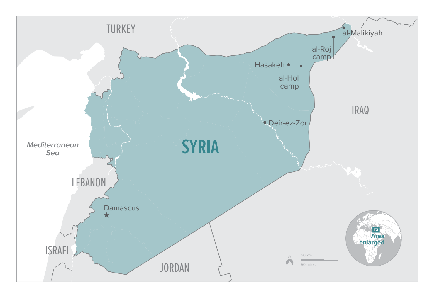
Syria Adapted from artwork by Rainer Lesniewski/Shutterstock

remained in 16 detention facilities, such as Dêrik prison in al-Malikiyah, near the border with Turkey, of whom around 8,000 were believed to be Syrian or Iragi.<sup>57</sup> These facilities are largely beyond the reach of researchers, although one Western official interviewed for this study observed that many facilities are makeshift, and the conditions are so poor that some inmates have died, and others have attempted escape.<sup>58</sup> Major incidents have included a mass breakout in April 2019 that was quelled with US air support and, in January 2022, a complex, audacious ISIS attack on Ghwayran prison in Hasakeh, leading to a nine-day battle with SDF troops and significant casualties.<sup>59</sup> An even bigger population comprises the refugees and IDPs in overcrowded former camps in northeastern Syria, the most well-known being al-Hol camp near the Iraq border in al-Hasakeh Governorate,