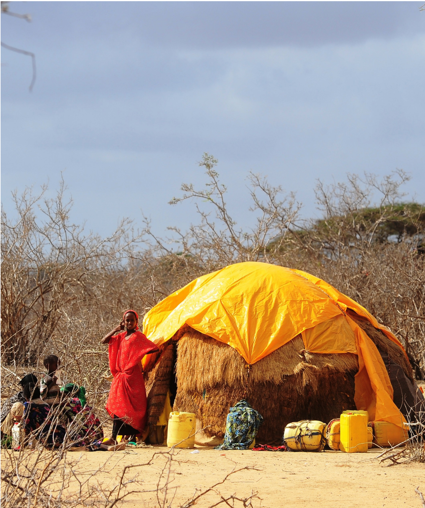
A refugee camp in Kenya.