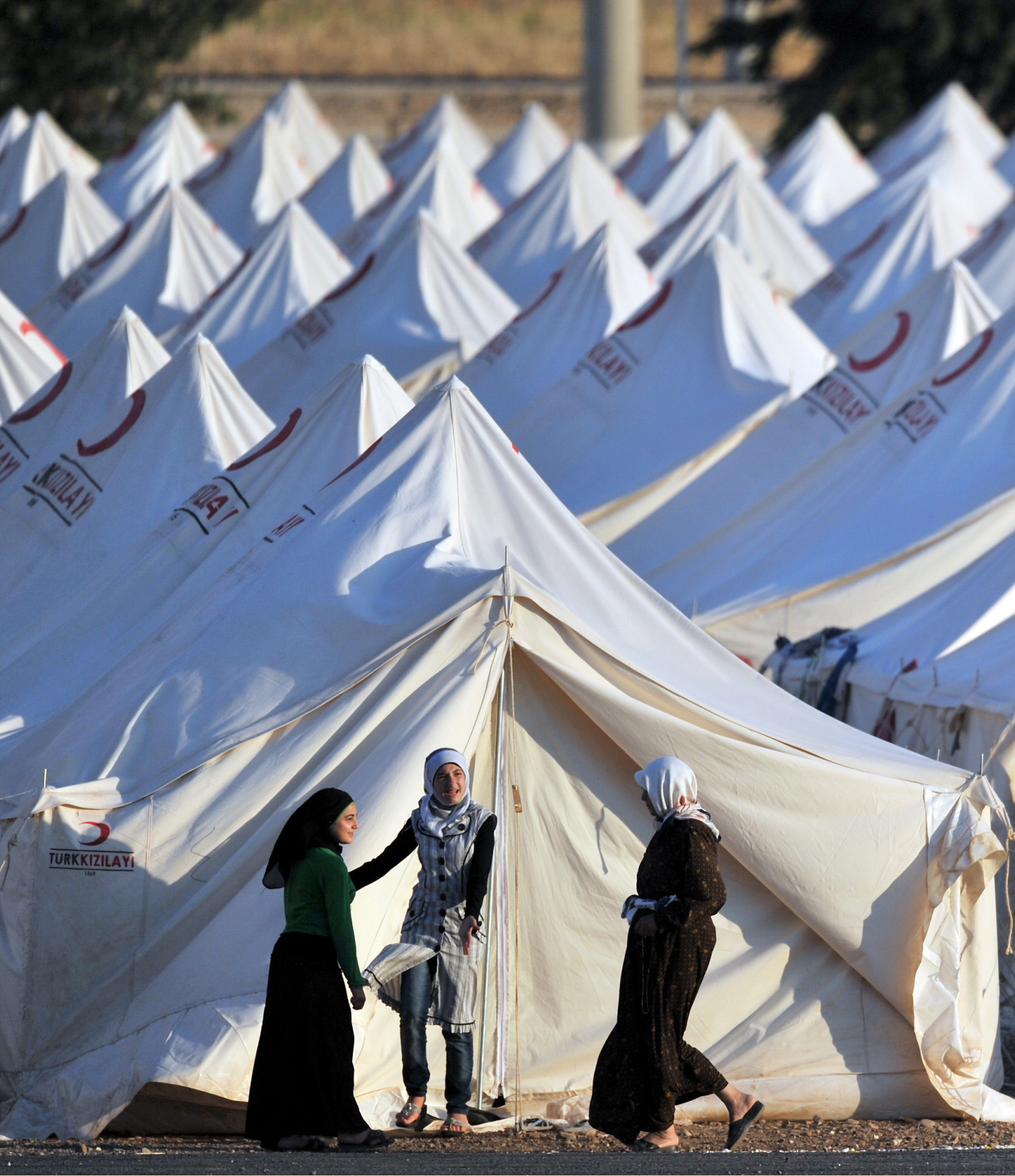
Syrian refugee camp on the Turkish - Syrian border.