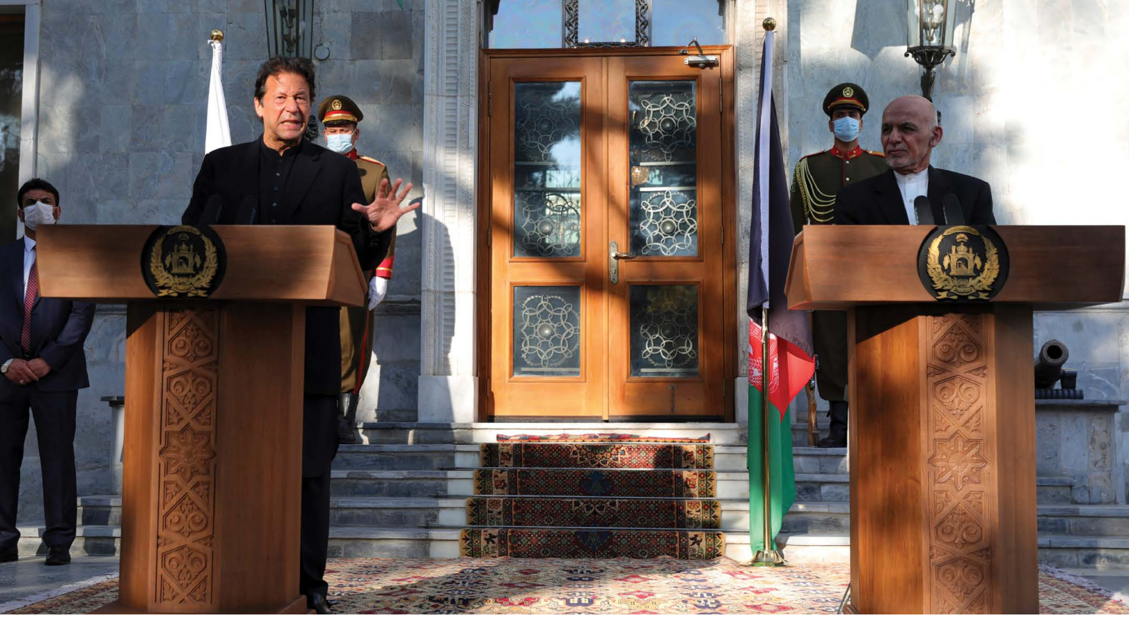
Pakistani Prime Minister Imran Khan, left, and Afghan President Ashraf Ghani attend a joint news conference at the Presidential Palace in Kabul on November 19, 2020.