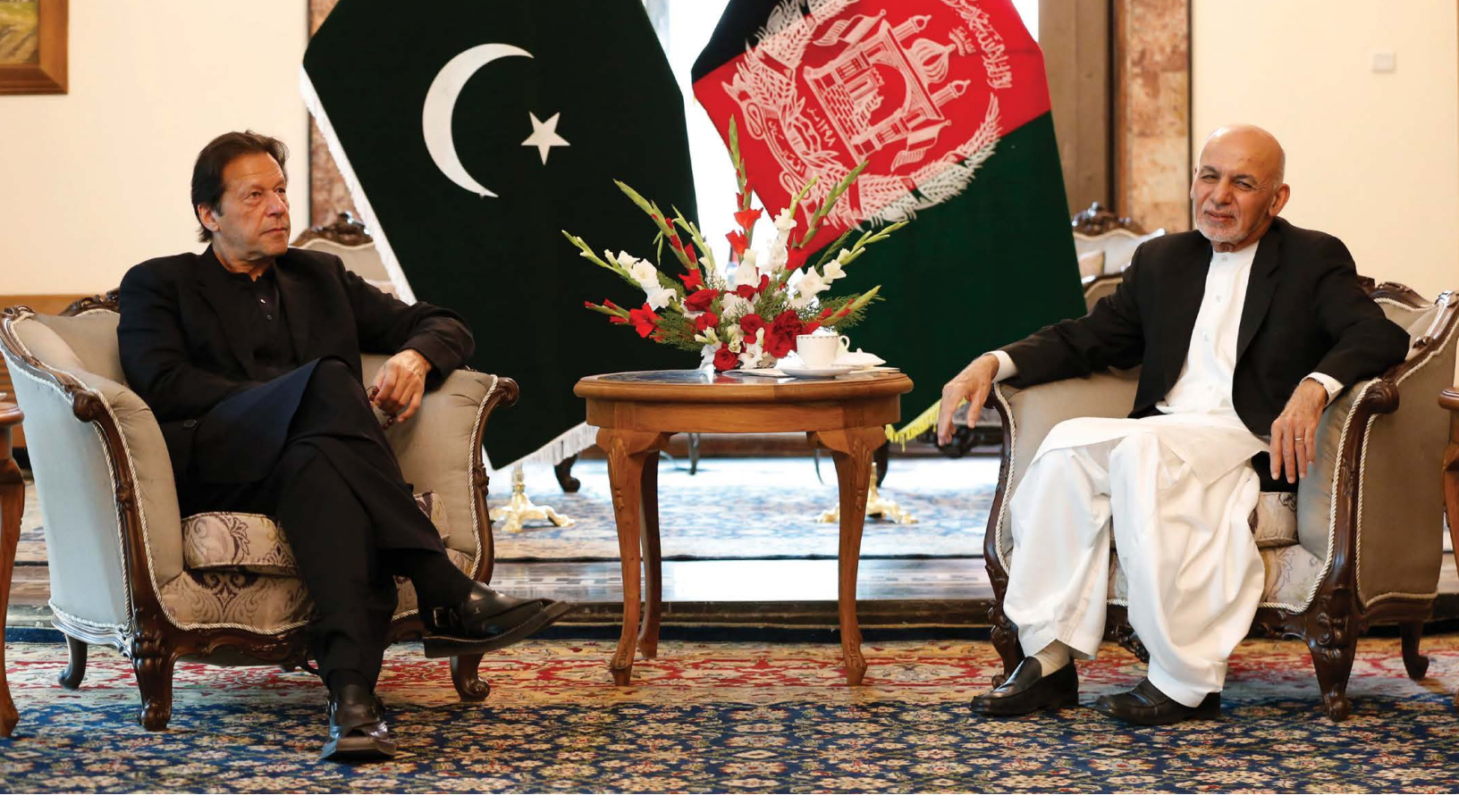
Afghan President Ashraf Ghani, right, meets with Pakistan's Prime Minister Imran Khan at the Presidential Palace in Kabul on November 19, 2020.