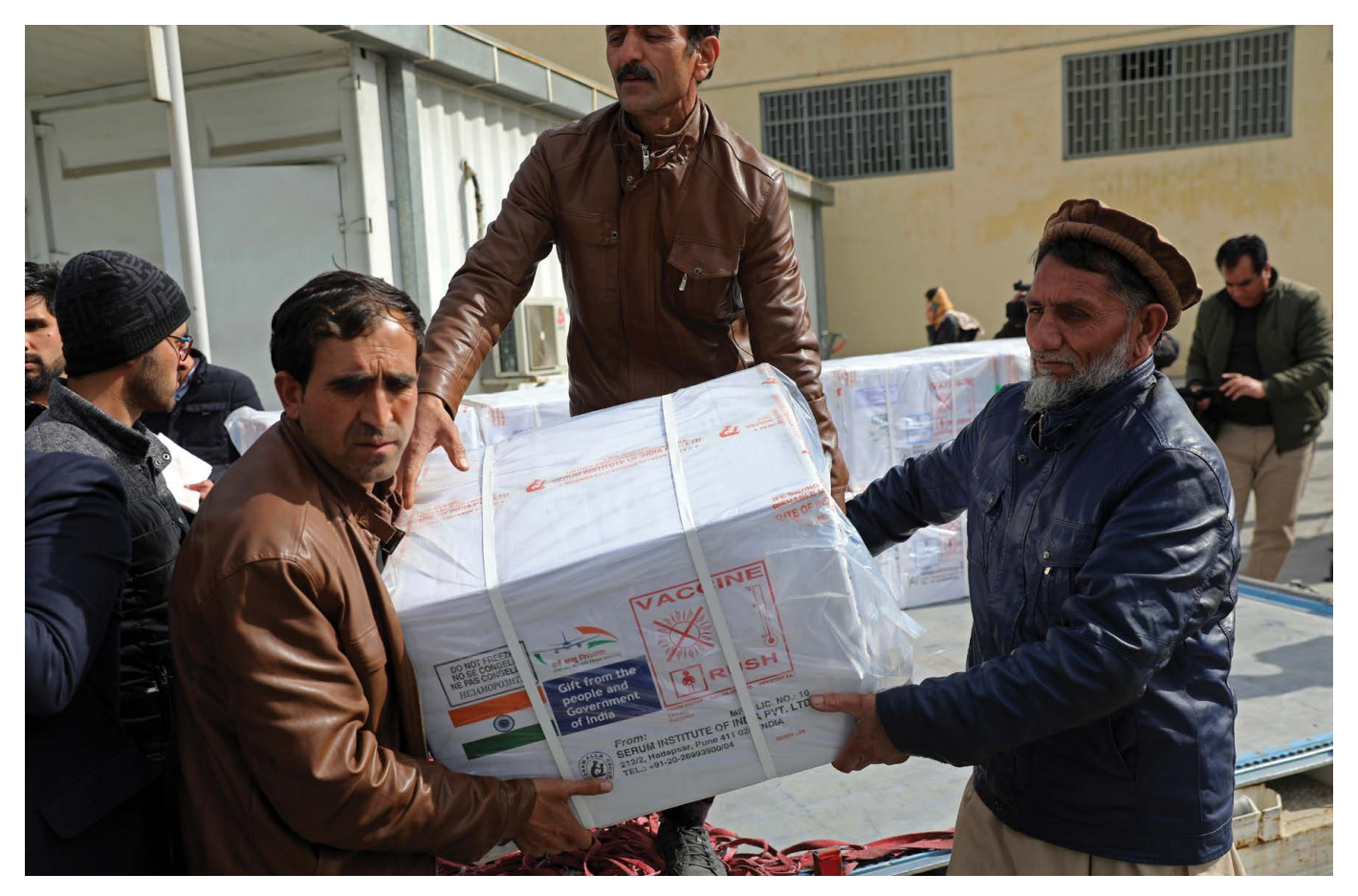
Afghan health ministry workers unload boxes of the first shipment of five hundred thousand doses of the AstraZeneca coronavirus vaccine made by the Serum Institute of India, donated by the Indian government to Afghanistan, on February 7, 2021.