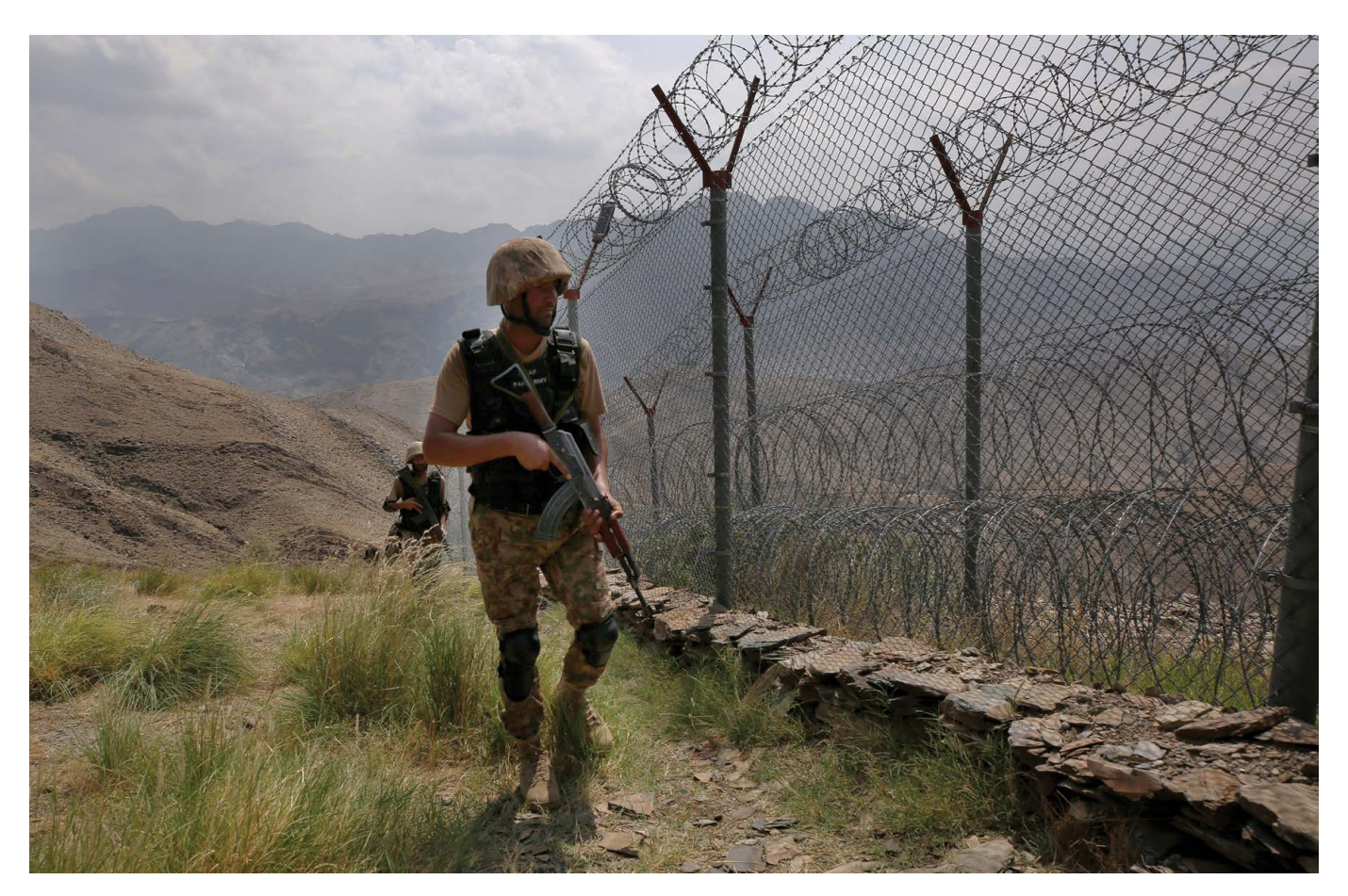
Pakistan Army troops patrol the fence on the Pakistan-Afghanistan border in Khyber District, Pakistan, on August 3, 2021.

"could be transgressed in the name of regional security." Such assertions fueled Afghans' grievance that Pakistan pursues its interests in Afghanistan without regard for sovereign Afghan territory.