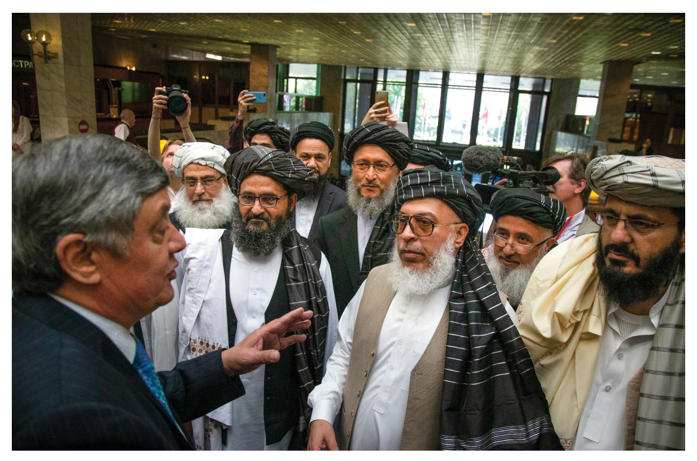
Russian presidential envoy to Afghanistan Zamir Kabulov, left, speaks to members of the Taliban delegation prior to their talks in Moscow on May 28, 2019.

A negotiated resolution remains unlikely, but it is not impossible even at this late stage. The Taliban could choose to come to the table after having demonstrated battlefield dominance to give its victory a pastiche of international legitimacy. The United States and others have warned that a government imposed by force would not receive much-needed financial assistance.61 The international community's support is also required to lift bilateral and UN Security Council sanctions on Taliban officials, a long-standing demand.<sup>62</sup> Indeed, the Taliban has said that it does not plan to take Kabul by force and reportedly will present a written peace proposal in talks in the near future, likely motivated by these considerations.<sup>63</sup> Although such statements should not be taken at face value, the group's military strategy suggests that it could seek to force the government's capitulation by cutting off the flow of funds and supplies rather than an all-out assault.