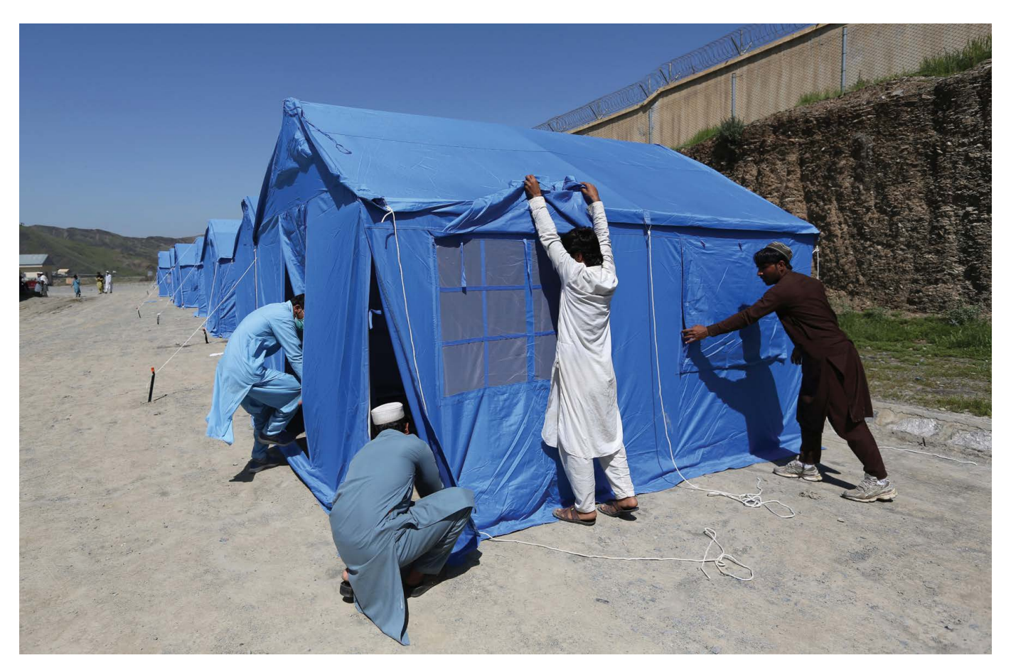
On April 4, 2020, Afghan municipal workers prepare tents for the first coronavirus quarantine camp for Afghan refugees using the Torkham border crossing to return from Pakistan.

concerns. Given anti-Pakistan sentiment in Afghanistan, the inclusion of Pashtun representatives could also provide cover for Afghan politicians to engage.<sup>86</sup>