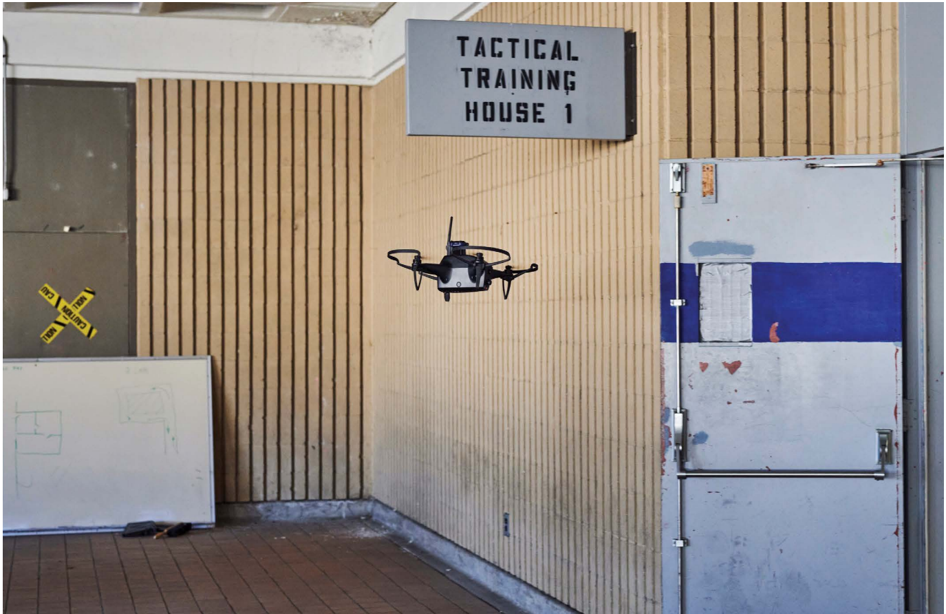
A demonstration flight of a drone made by Shield AI, a private company based in San Diego, California, on November 11, 2020.

In terms of early warning and ISR , AI can enable faster and more comprehensive tools that enhance nuclear decision-makers' situational awareness and allow them to make better informed time-critical decisions. For example, some US officials have discussed using Project Maven—which applies machine-learning to sort through masses of ISR data—in the Air Force's Advanced Battle Management System to promote joint command and control across all five warfighting domains: air, land, sea, space, and cyberspace. 16 For countries such as China that have concerns over a prompt and precise conventional strike against their nuclear forces and NC3, the ability to improve monitoring and reaction times is also compelling. Chinese experts express particular concern over AI-enabled remote-sensing systems on autonomous surface or underwater vehicles weakening deterrence at sea. 17