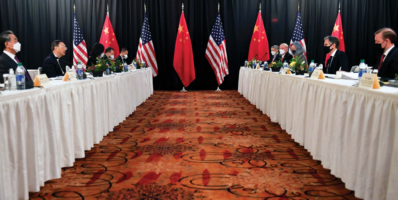
Secretary of State Antony Blinken and National Security Advisor Jake Sullivan speak with Chinese Communist Party foreign affairs chief Yang Jiechi and Foreign Affairs Minister Wang Yi at US-China talks in Anchorage, Alaska, on March 18, 2021.