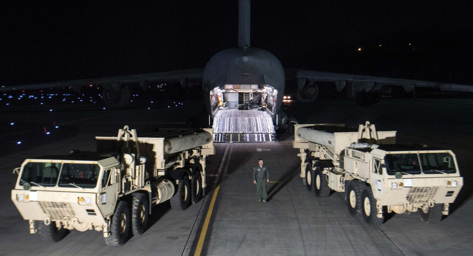
Trucks carrying parts of missile launchers and other equipment needed to set up the United States' Terminal High Altitude Area Defense anti-ballistic missile system arrive at Osan Air Base in Pyeongtaek, South Korea.