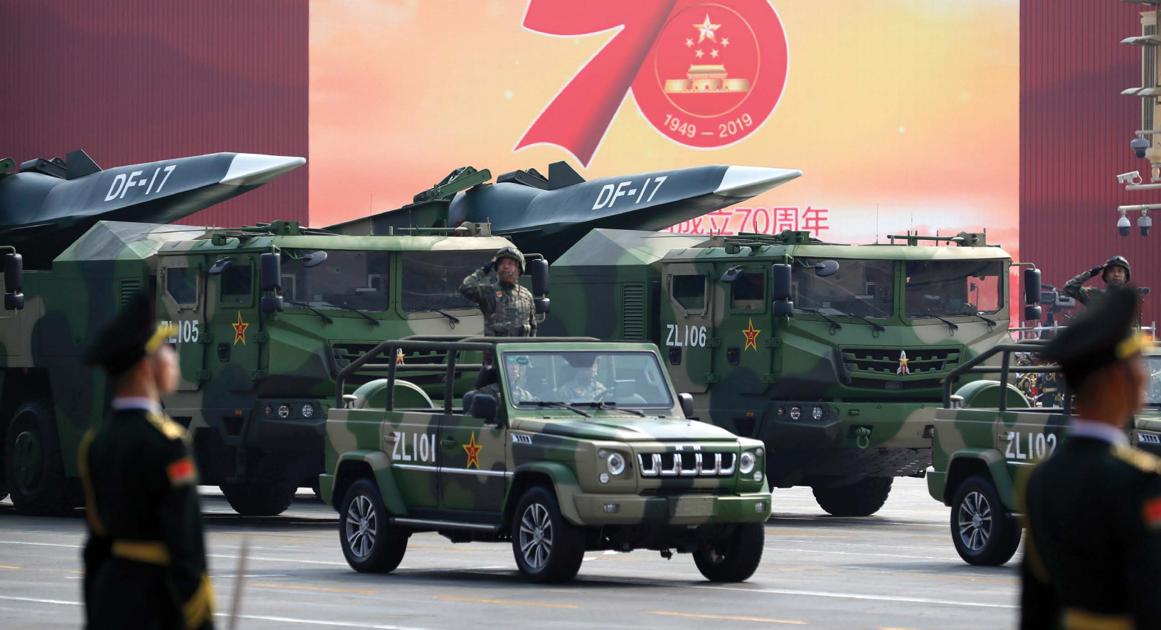
Chinese military vehicles carry DF-17 ballistic missiles during a parade in Beijing on October 1, 2019, commemorating the 70th anniversary of the founding of the People's Republic of China.