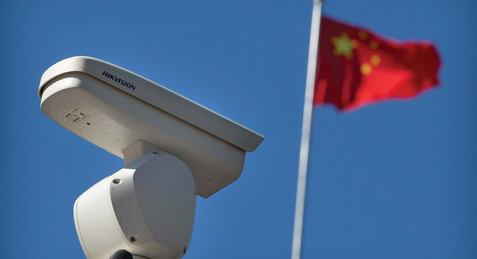
A Chinese flag flies near a Hikvision security camera monitoring a traffic intersection in Beijing on October 8, 2019.