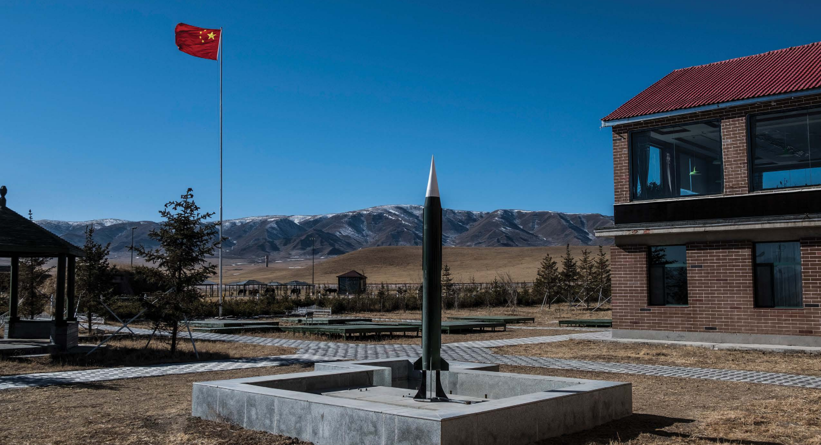
The remnants of Plant 221, shown here on January 9, 2018, is the once-secret facility in China's northwest Qinghai Province where scientists built and detonated the country's first nuclear weapon in 1964.