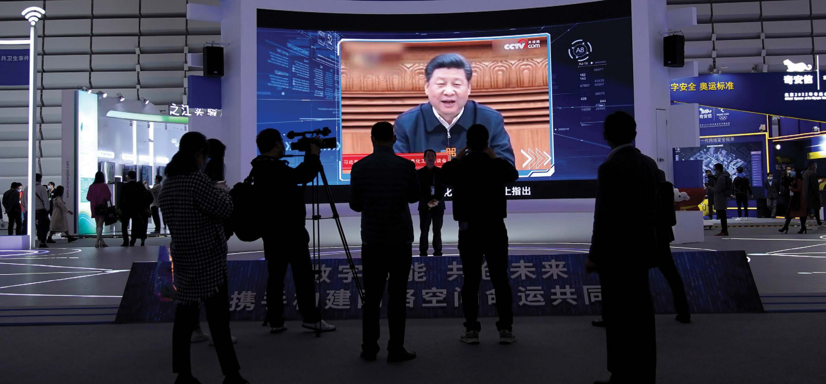
China's President Xi Jinping on screen during the World Internet Conference in Wuzhen, China, in November 2020. President Donald Trump subsequently banned US telecommunications firms from installing foreign-made equipment that could pose a threat to US national security.