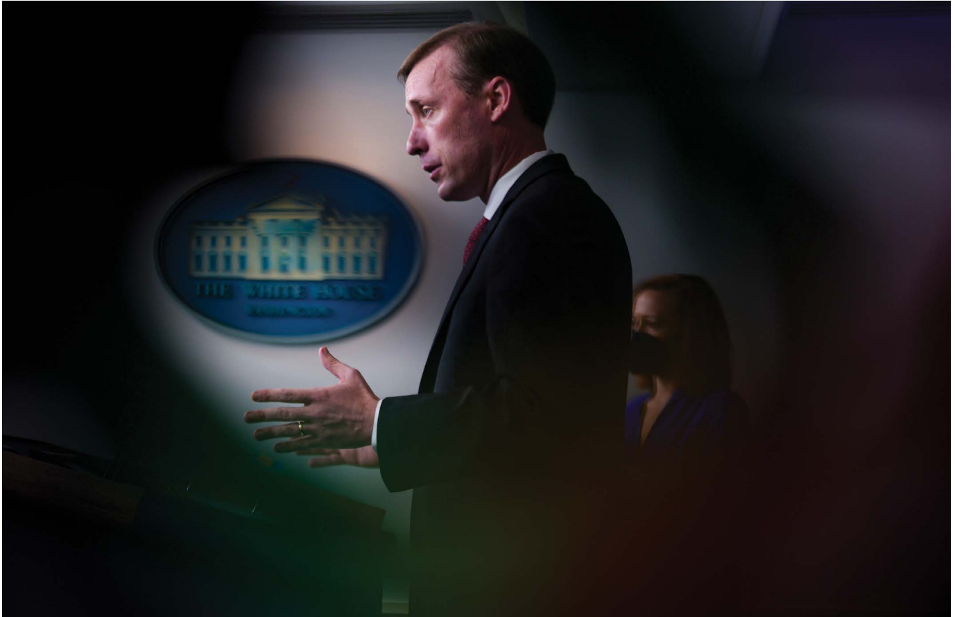
National Security Advisor Jake Sullivan speaks at the White House on March, 12, 2021. The sophisticated hacks pulled off by Russia and China are driving the Biden administration and Congress to rethink how the nation should protect itself from growing cyberthreats.

competition and political mistrust. The overall worsening of the security environment between Washington and Beijing appears to raise the possibility that a cyber-attack will spill over into kinetic conflict.