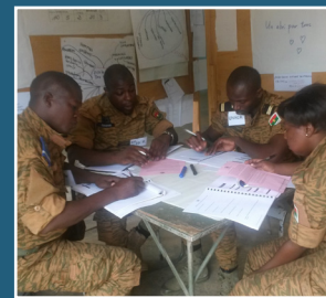
Burkina Faso 2016

To learn more about our Conflict Management Training Program for Peacekeepers, visit our website, www.usip.org/CMTTP