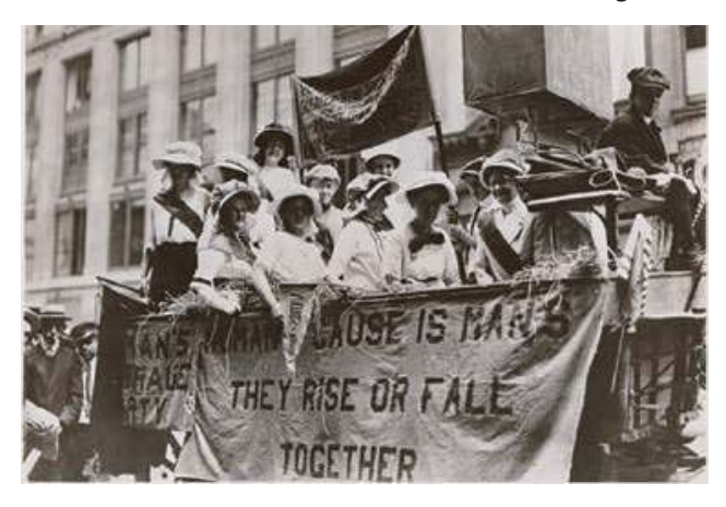
Photograph of Suffrage Parade in New York City, 1913. Courtesy of the National Archives and Records Administration (208-PR-14M-3).

One of the most successful social movements in United States history, women's suffrage is an example of how nonviolent resistance and peaceful activism in the face of discrimination can lead to effective social change.