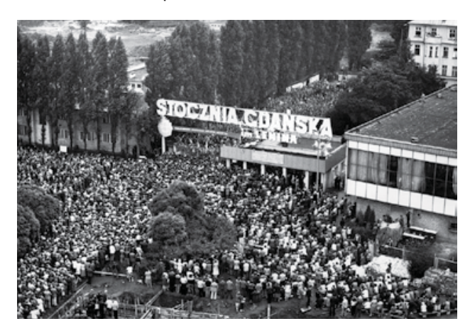
Strike at the Vladimir Lenin Shipyard in Gdansk, Poland, August 1980.

the country's political discourse and made the press an important driving force of the revolution. This method has influenced modern social movements, where all forms of media are used as means to inform, to unify, and to mobilize in peaceful revolution.4