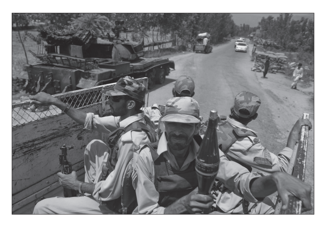
PEACEWORKS • SEPTEMBER 2013 • NO. 89