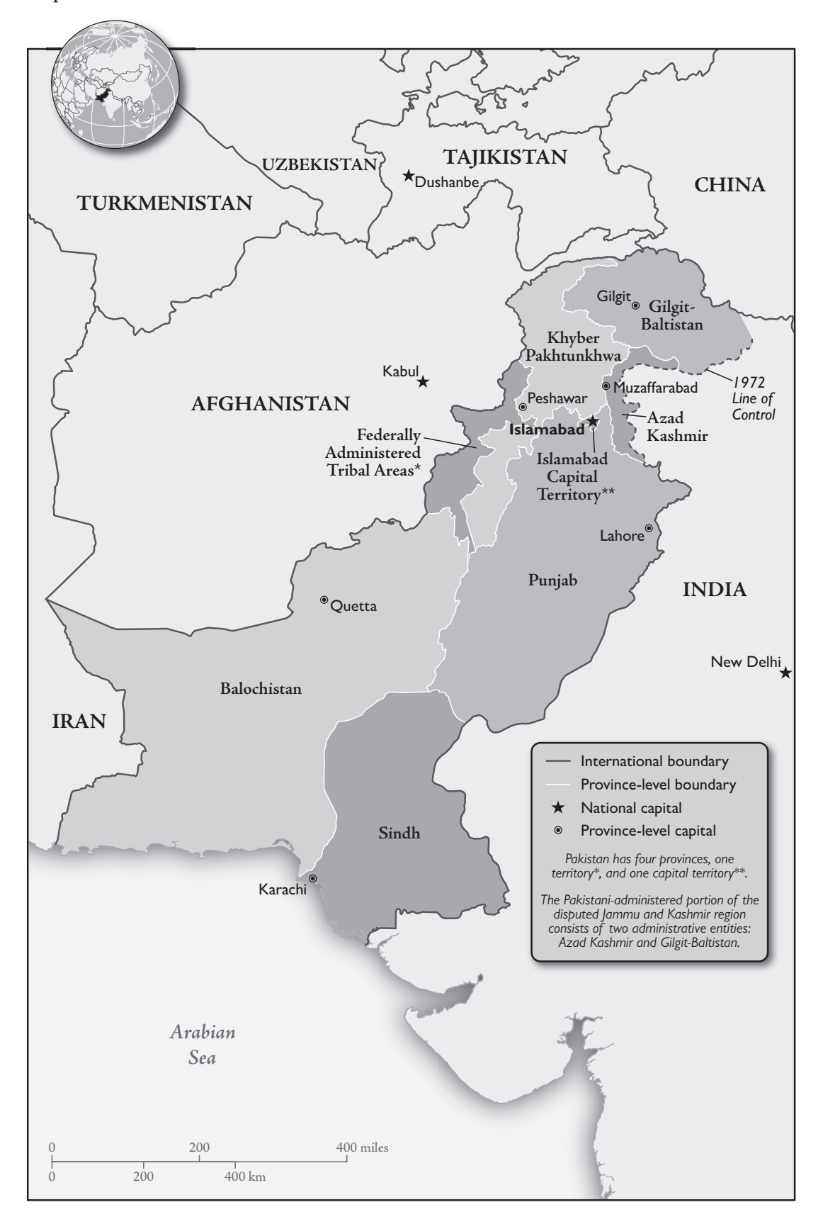
Map 1. Pakistan Administrative Districts