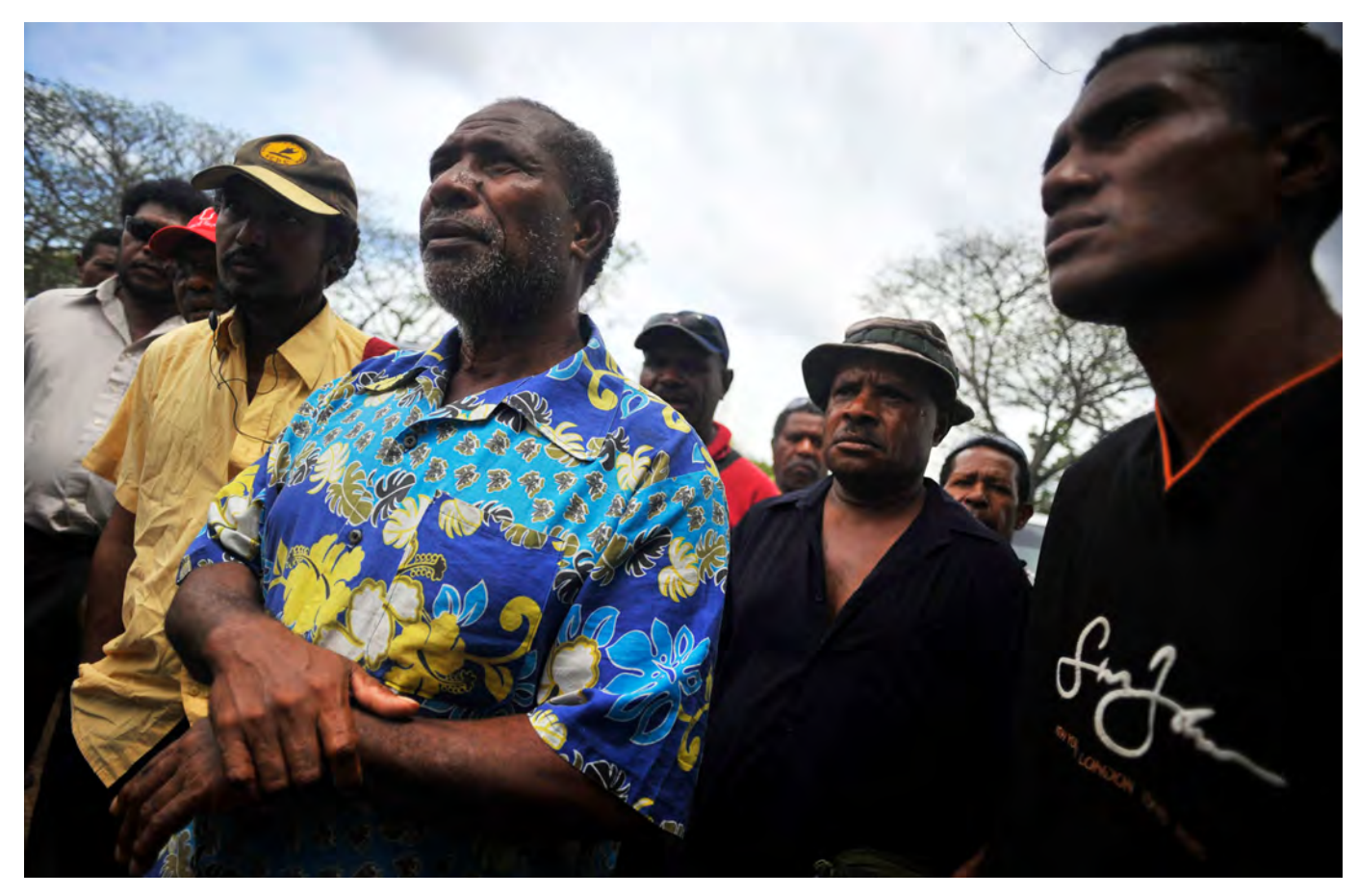
Landowners seeking money promised from a government deal with ExxonMobil gathered outside the Department of Commerce and Industry in Port Moresby, Papua New Guinea, on September 14, 2010. Sharpened perceptions of poverty and deprivation fuel an already volatile social environment.

obedience to male family members; domestic violence is endorsed by both men and women to discipline women who "fail" to conform to these ideas of virtuous womanhood.<sup>77</sup>