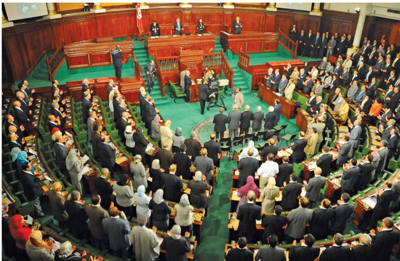
Tunisia's newly elected constituent assembly holds its inaugural meeting on November 22, 2011, in Tunis. The Islamist Ennahda party won the most seats in the assembly, escalating conflict over the role of Islam in public life.

often moderating their critiques to keep open lines of communication with the (more sympathetic) government. 46