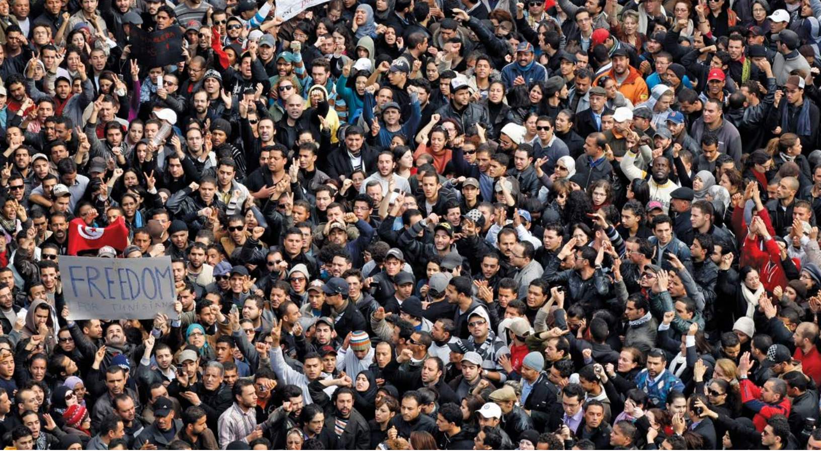
Protesters demonstrate against President Zine el Abidine Ben Ali in Tunis, Tunisia, on January 14, 2011. The longtime authoritarian leader left the country for Saudi Arabia that day.