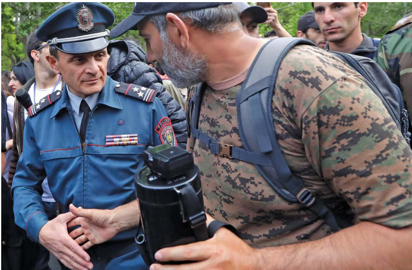
Armenian opposition leader Nikol Pashinyan, right, shakes hands with a police officer in Yerevan, Armenia, on April 29, 2018. On May 8, Pashinyan would be elected prime minister.

the Velvet Revolution was over as Armenia's parliament elected Pashinyan prime minister. 12