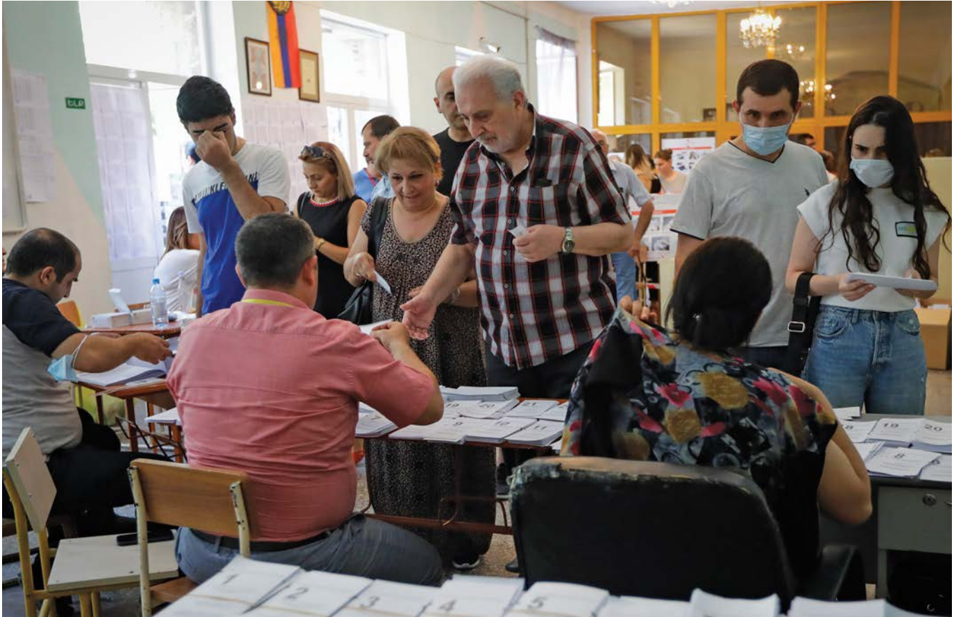
People visit a polling station in Yerevan during Armenia's parliamentary election on June 20, 2021. The election took place after a renewal of armed conflict with Azerbaijan put the postrevolutionary government of Prime Minister Nikol Pashinyan at risk.

on localizing the provision of aid (such as USAID's vision for local development) are good steps in this direction. 65 Similarly, international partners need to incorporate avenues for local agency early on, in the initial program design phase. Codesign processes, such as listening campaigns and codesign workshops, should be foundational elements of future foreign assistance programs and lay the groundwork for local ownership in the implementation phase.